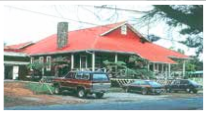
Parker School in 1979.