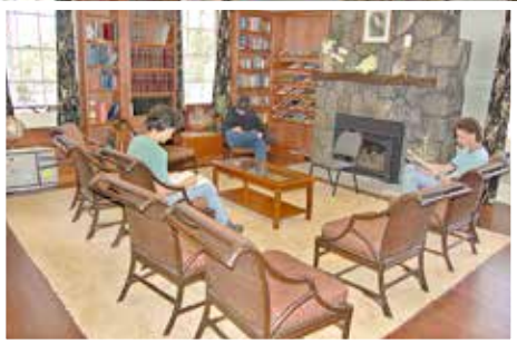
Parker School adds a library inside Kahilu Hall in 2007.

Parker School adds a student library in Kahilu Hall. The library features the original fireplace and original hardwood floors.