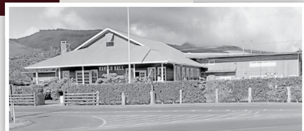
Kahilu Hall circa 1960.