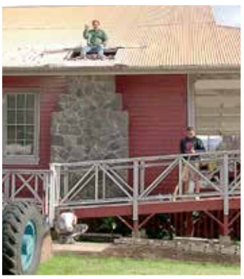
Kahilu Hall's chimney is damaged in 2006 earthquake.

Part of the original lava rock chimney in Kahilu Hall is removed for safety reasons January 30 after sustaining damage in the October 15, 2006 earthquake measuring 6.7.