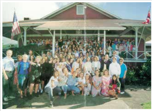
Parker School students in 1991.

Parker School welcomes World War II veterans once stationed at Camp Tarawa to the former USO (Kahilu Hall) for a special ceremony and luncheon March 19 as part of town-wide festivities to commemorate the 50th Anniversary of Camp Tarawa. On September 9, Parker School hosts the final 50th Anniversary celebration with a dance for veterans and the community at Kahilu Hall.