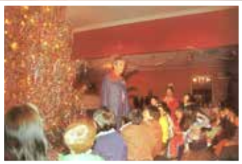
Parker Ranch's employee Christmas Party in 1976 at Kahilu Hall.