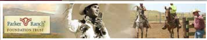
Parker School becomes one of four beneficiaries of the Parker Ranch Foundation Trust.