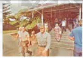
State of the Ranch Meeting in 1976 at Kahilu Hall.